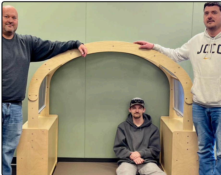
A HUGE SHOUT OUT TO THE PARKS & REC CREW FOR PUTTING TOGETHER OUR NEW READING CUBBY

📖🐾 Storytime Just Got a Snooze Button! 🐾📖